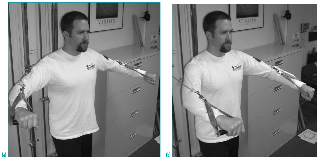
Figure 5 Dynamic hug (a) start position and (b) bilateral humeral horizontal flexion.