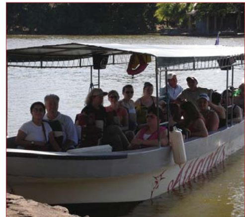
Student leaders and supervisors on a boat trip to explore the culture of the Granada Islands on Lake Nicaragua.