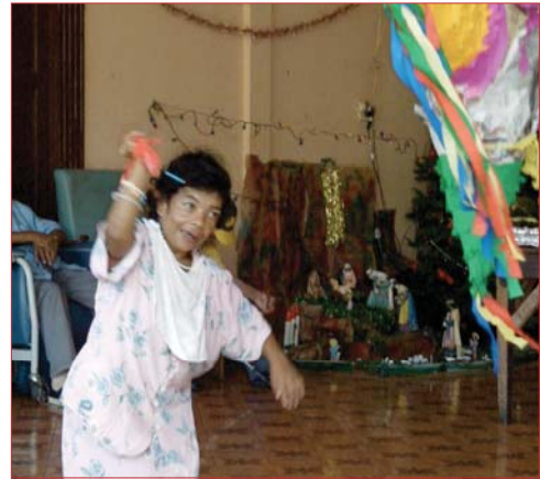
A resident engaging in a piñata activity during the New Year's Day fiesta. Her functional abilities utilizing balance, strength and range of motion could easily be observed.