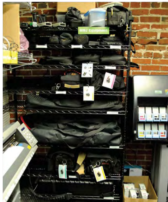
Equipment used to support the Multimedia Journalism (MMJ) program is housed in the UO Portland's Output Room.

equipment widely used in the journalism trade such as multimedia camera kits, digital recording equipment and tripods. The Library's supporting Output Room circulates this equipment to all qualifying MMJ students and acts as steward of the collection by housing, inventorying and circulating the kits to the Library's patrons. While the Library does not directly own this collection, we are accountable for maintaining and safely securing the items.