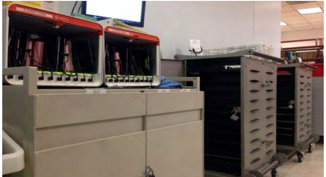
Equipment storage in Access Services at PSU.

equipment widely used in the journalism trade such as multimedia camera kits, digital recording equipment and tripods. The Library's supporting Output Room circulates this equipment to all qualifying MMJ students and acts as steward of the collection by housing, inventorying and circulating the kits to the Library's patrons. While the Library does not directly own this collection, we are accountable for maintaining and safely securing the items.