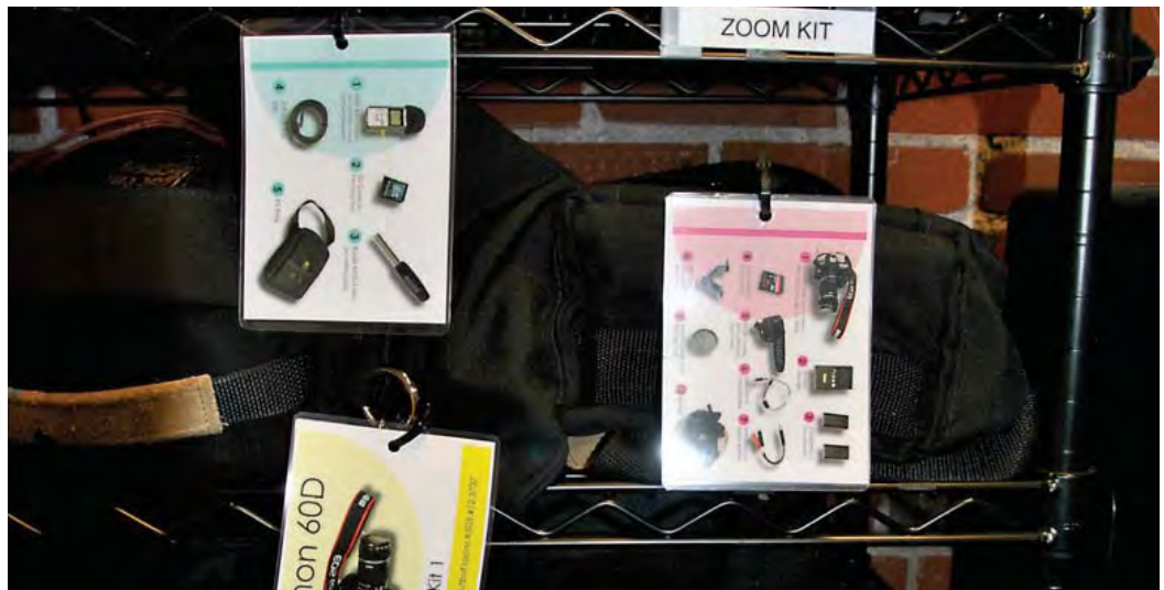
MMJ tags are color-coded and clearly labeled for ease of training. Photos are large to highlight the numerous components of a kit.

MOLLY: In the summer of 2014, we added an additional five laptops for students with accessibility issues, by partnering with the Disability Resource Center (DRC). Having these laptops available aligns with the mission of the DRC to remove student barriers to access in all aspects of their learning experience, and the library is pleased to be able to help support this service. The five computers are equipped with Job Access With Speech (JAWS), Dragon Naturally Speaking (speech-to-text) and Kurzweil 3000 (speech-to-text and literacy tools). Because the software requires a bit more training and support, we allow students to leave the library with the laptops in case they need to go to the DRC for assistance. The accessibility laptops do not circulate heavily but have a few dedicated users.