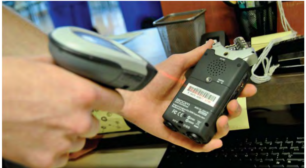
A UO Portland student checks out an item to a patron.

MOLLY: The PSU Library began our equipment lending program five years ago with a small number of laptops. We began lending laptops as a pilot program in the summer of 2011, starting with 20 laptops and allowing them to circulate for two hours at a time. By the end of September, we had feedback from students that the two-hour checkout was not long enough and extended the loan period to three hours. We have added 30 more laptops since the pilot program began. In addition to laptops, we began adding other equipment items to our enhance our lending program and now circulate a number of different items: headphones, phone chargers, adapters, pocket projectors, Bluetooth keyboards, iPads, and scientific calculators. All of these items check out for three hours at a time, and only students can check them out. Audio/Visual (A/V) Services are handled separately by the Office of Information Technologies. We chose items that made sense to check out as a library and were common requests from students.